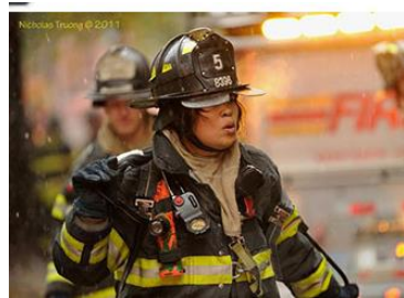
Women Firefighters in the FDNY

We invite you to visit the Puffin Gallery for Social Activism at this museum, and to visit online exhibits from LaborArts, including